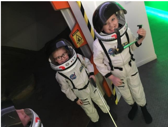
Some of our Year 5's at the Space Centre enjoying their astronaut experience!

There will be more dates and letters coming out regarding trips etc in the weeks to come.