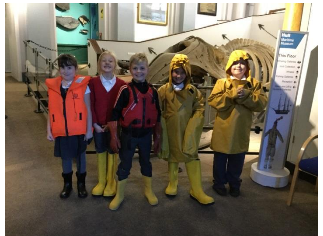
Some Year 3's on their trip to Hull Maritime Museum!