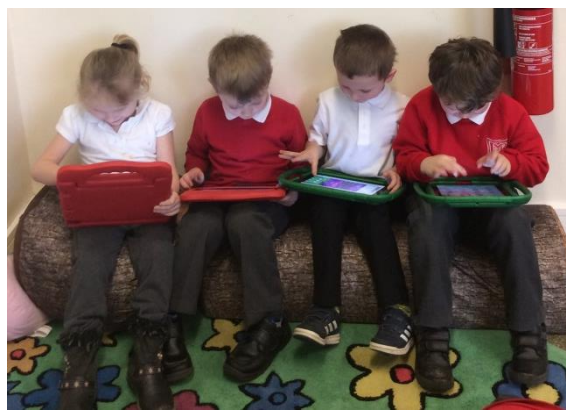
Year 1 doing some investigation on the iPads!