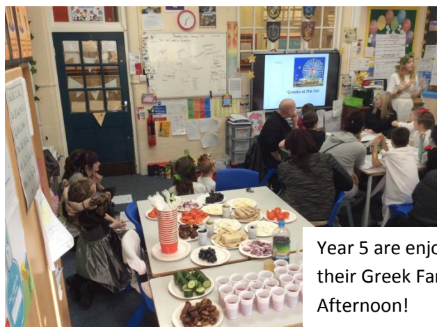
Year 5 are enjoying their Greek Family Afternoon!