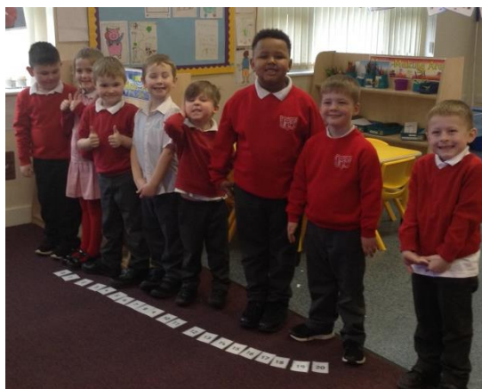
Here are Foundation Stage ordering a number line in maths!