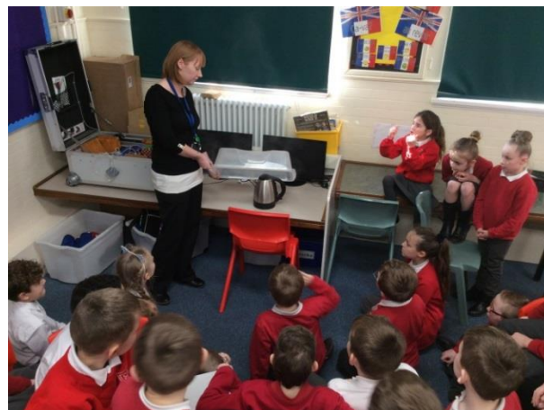
Year 4 have been doing scientific investigations about water!