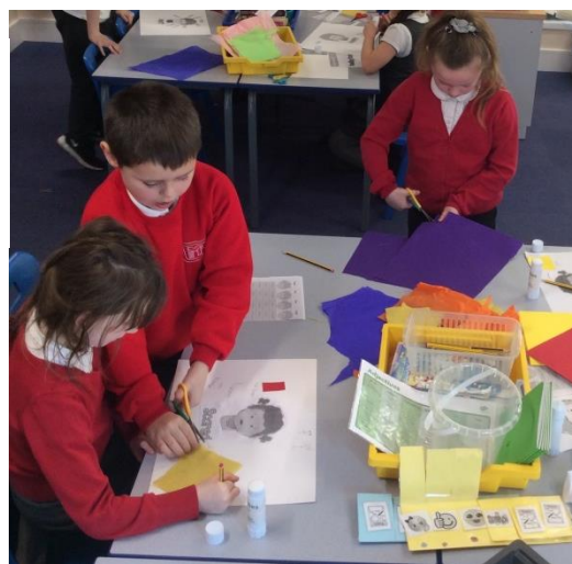
Year 3 have been making posters about feelings!