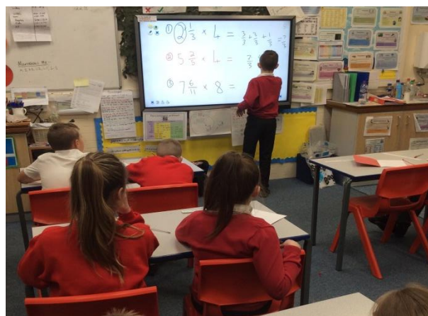
Year 6 have been teaching each other and doing a fantastic job!